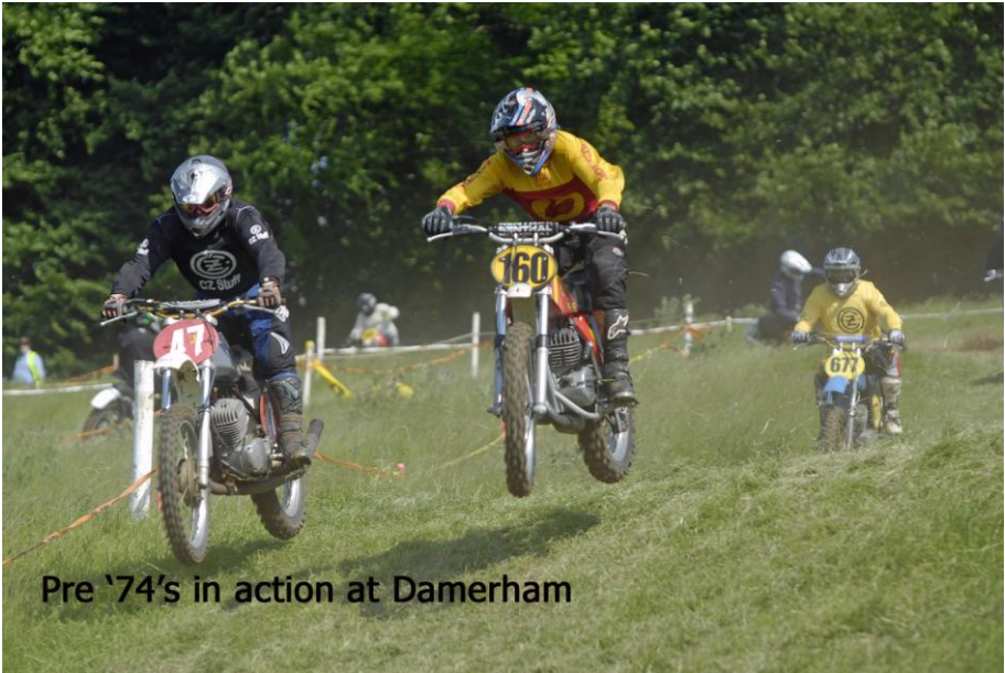
Pre '74's in action at Damerham